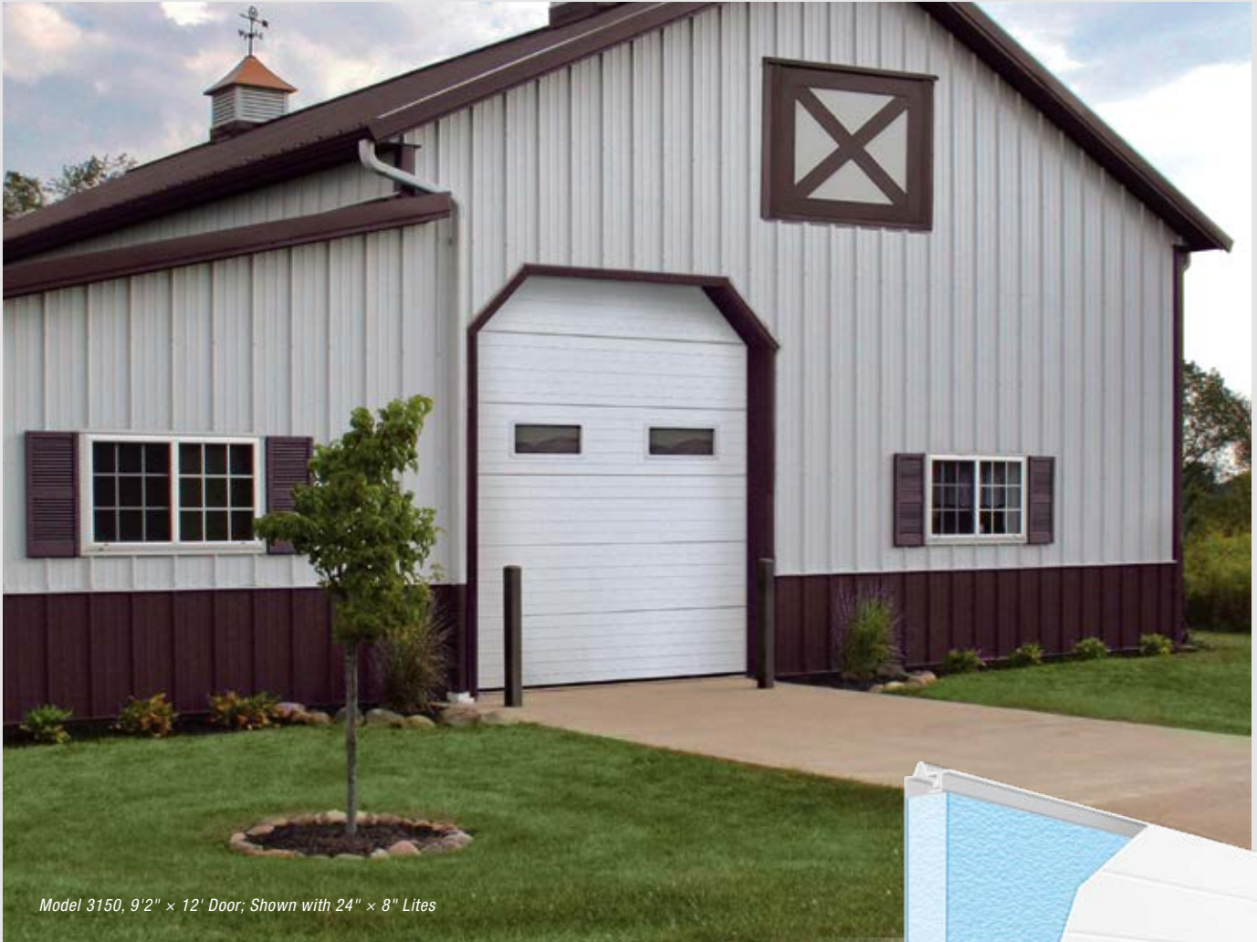
Model 3150, 9'2" x 12' Door; Shown with 24" x 8" Lites