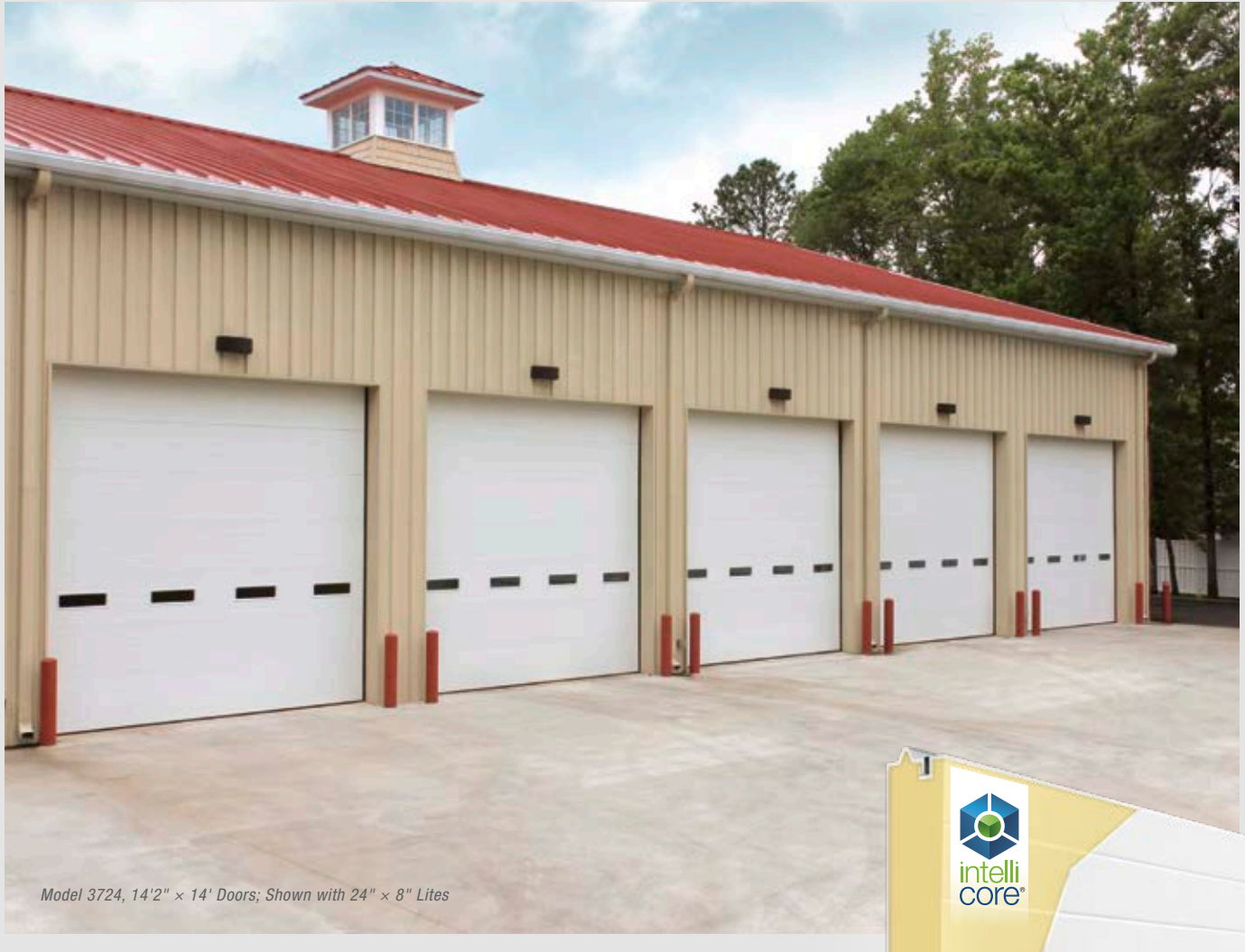
Model 3724, 14'2" x 14' Doors; Shown with 24" x 8" Lites